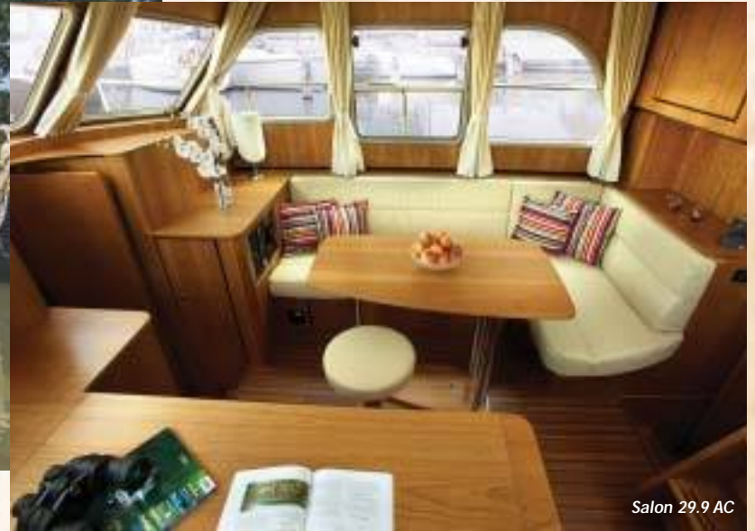
Salon 29.9 AC