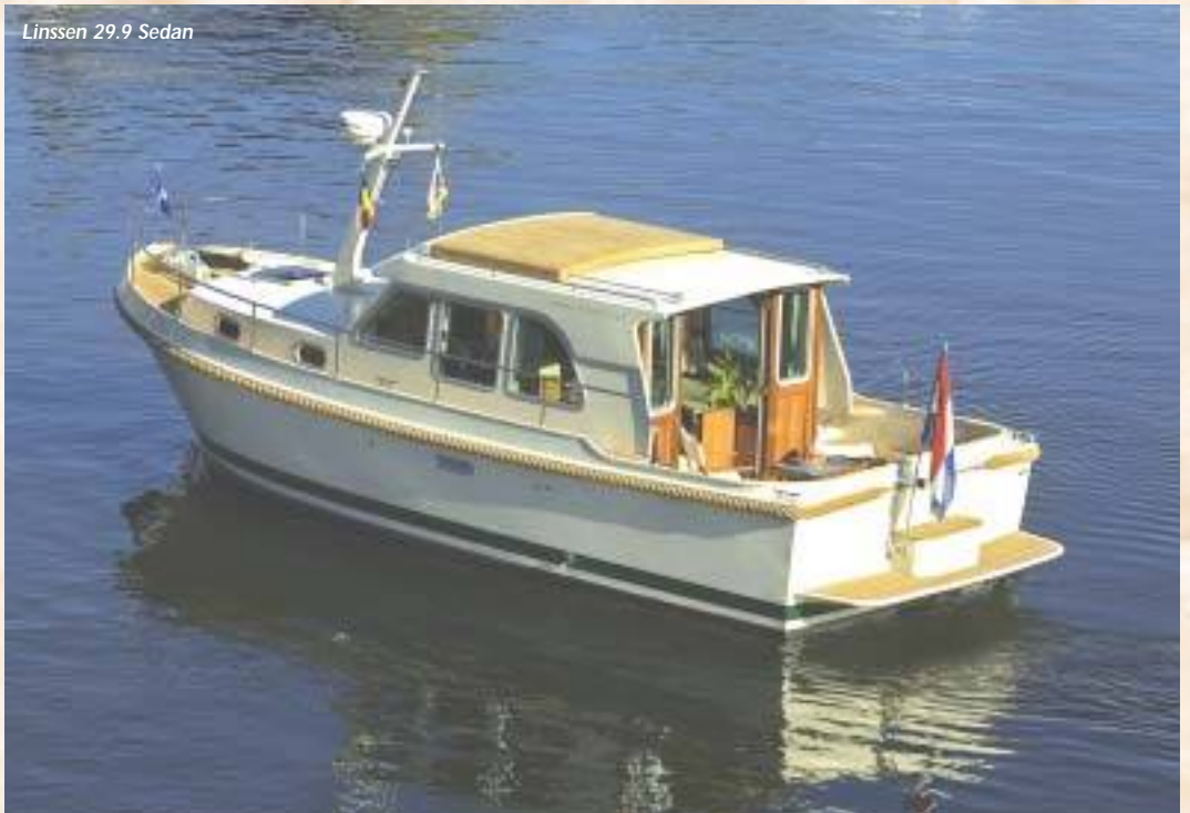
Linssen 29.9 Sedan

The boat layouts, pictures and descriptions are for general guidance only. Some boats may have minor variations e.g. bed positions, appliance positions, trim colours etc.