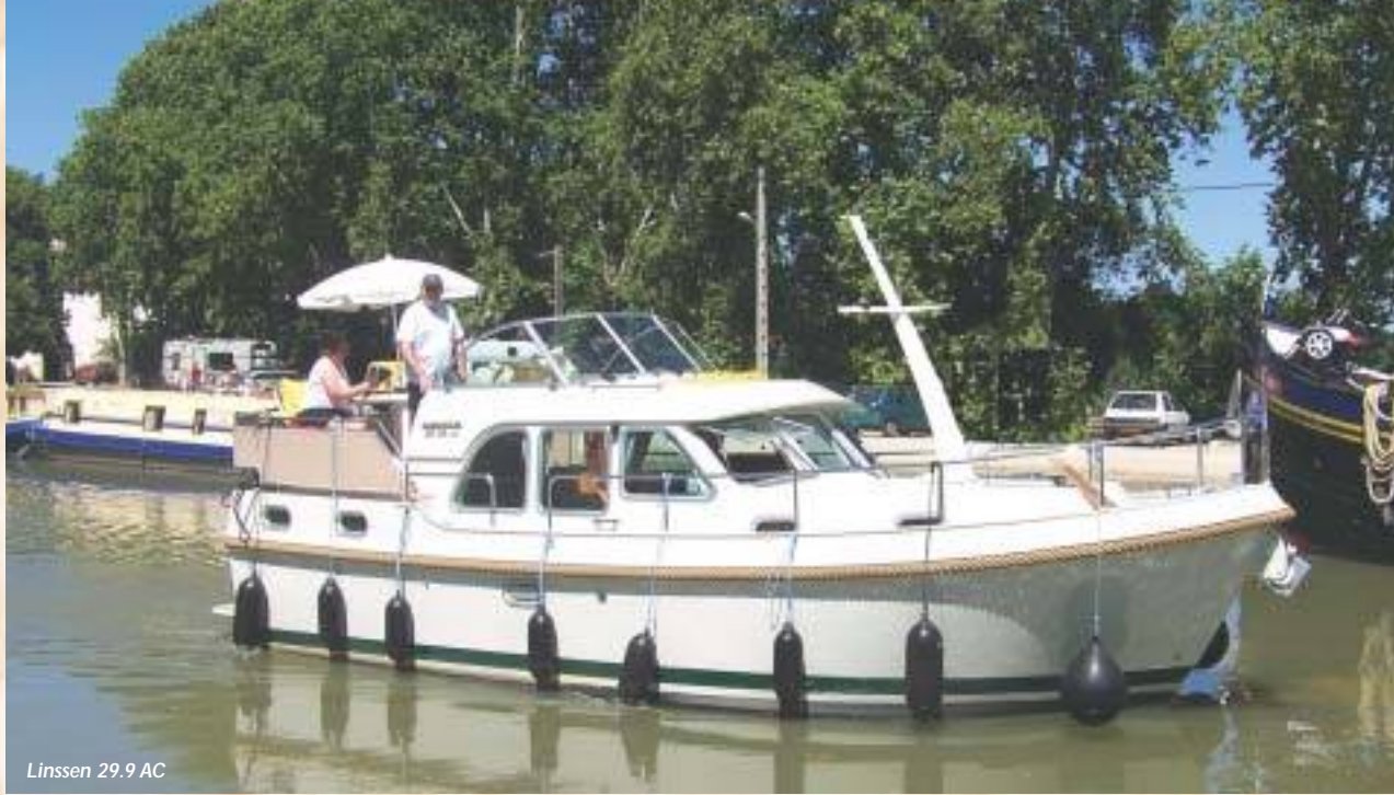
Linssen 29.9 AC